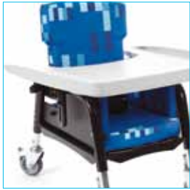
LES/#/A Height adjustable tray