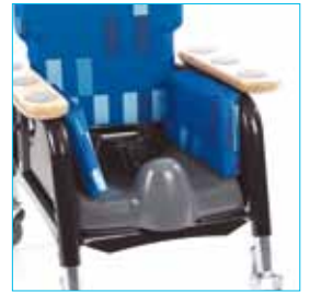
LES/#/S Potty insert