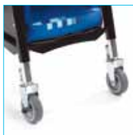
Height adjustable castor legs