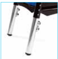
Height adjustable legs