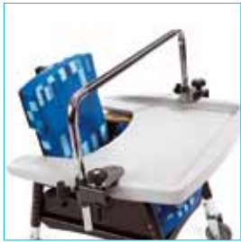
LES/#/I Grab rail