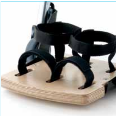
Footplate and sandals