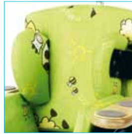
LES/#/E Rigid lateral supports