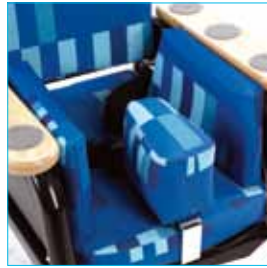
LES/#/C Adjustable pommel