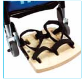
LES/#/F Footplate LES/#/N With sandal straps