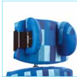
LES/#/L Flat high back LES/#/M Laterals for Flat high back