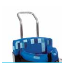
LES/#/Q Push handle