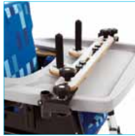
LES/#/P Grab posts