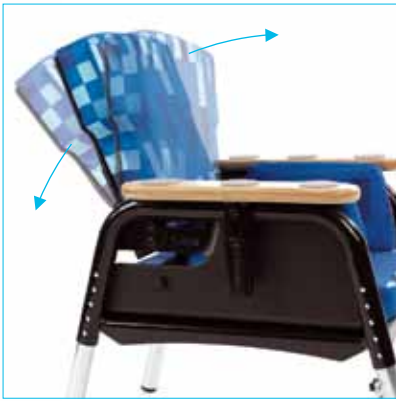
Angle adjustable backrest