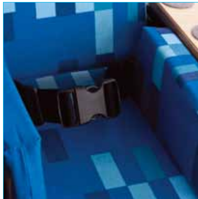
45° pelvic belt