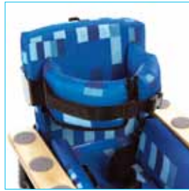
LES/#/D Flexible lateral supports