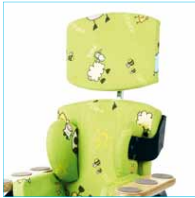
Additional headrest option.