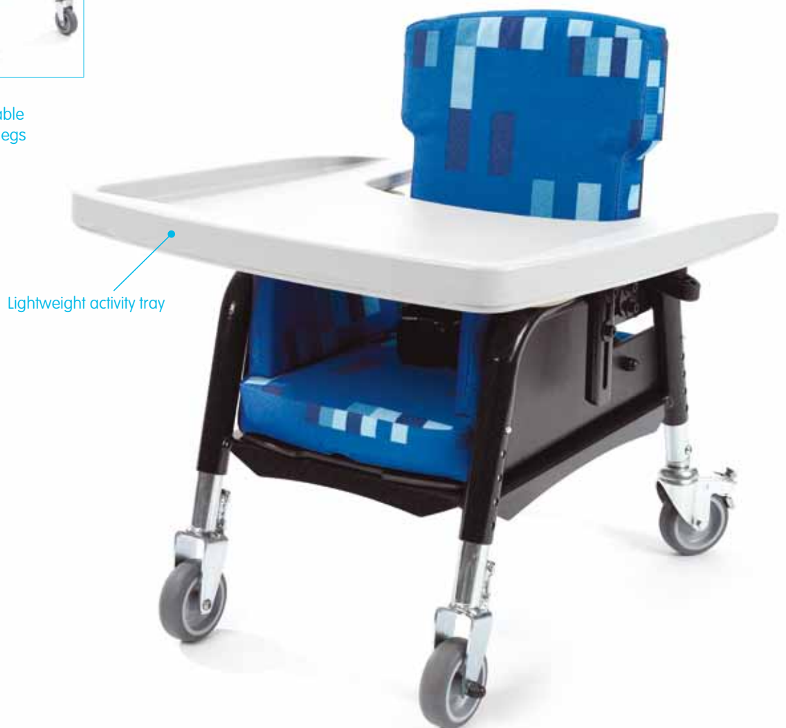
Lightweight activity tray

The Easy Seat was specifically designed to provide an attractive seating solution without compromising the postural needs of the less involved child.