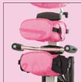
129-700 Pelvic support harness (Mobility)