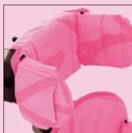
120-793 Flat headrest lateral supports +01 Green +02 Orange +03 Blue +04 Pink