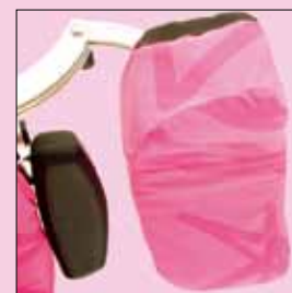
118-753 Contoured headrest +01 Green +02 Orange +03 Blue + 04 Pink