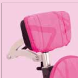
120-792 Flat headrest cushion +01 Green +02 Orange +03 Blue +04 Pink