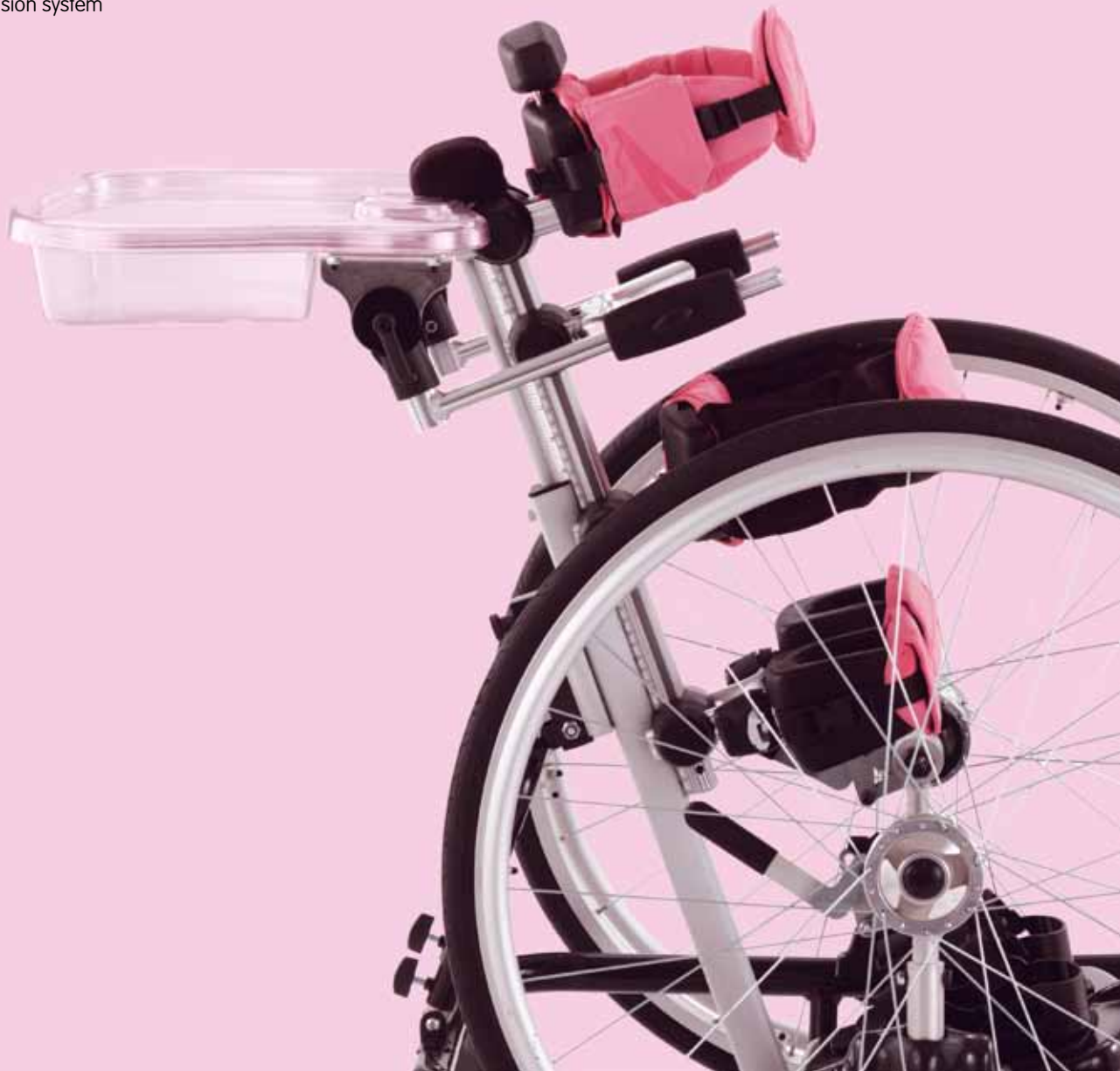
7. Clear plastic tray