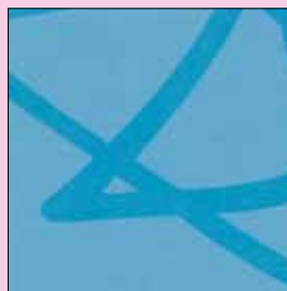
118-762 Stander covers Blue