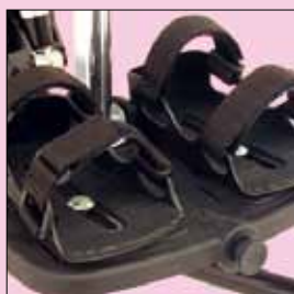
117-781 Sandals - small 117-782 Sandals - medium