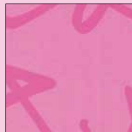
118-763 Stander covers Pink

Covers Include: Support Harnesses (2) and Support Cushions (2), Lateral Covers (2 Pairs), Kneepads (1 Pair), Spine Cap Cover.