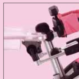
129-701 Spine cap cover