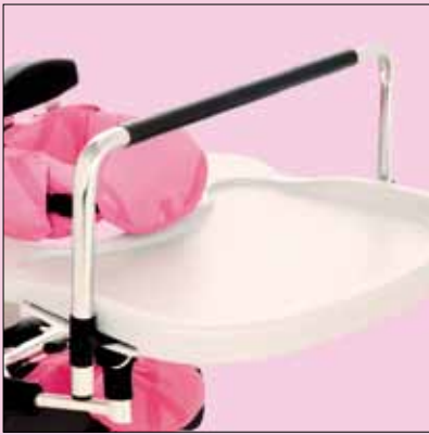
7. Contoured large activity tray