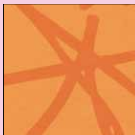
118-761 Stander covers Orange