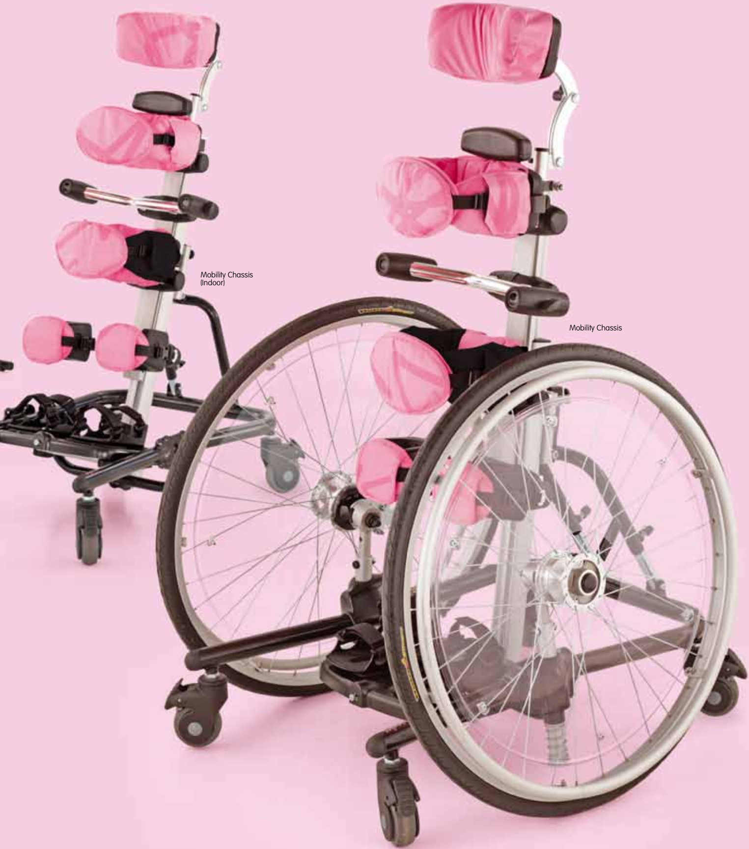
Mobility Chassis (Indoor)