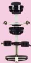
118-600 Standing system: Stander support shell