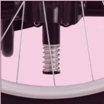
Mobility chassis: Unique wheel suspension system