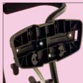
118-697 Headrest support