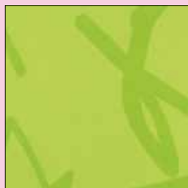
118-760 Stander covers Green