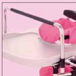
118-619 Tray 117-769 Grab rail